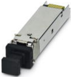
Gigabit SFP module for transmission up to 1 km with a wavelength of 850 nm.

Please be informed that the data shown in this PDF Document is generated from our Online Catalog. Please find the complete data in the user's documentation. Our General Terms of Use for Downloads are valid ( http://phoenixcontact.com/download )